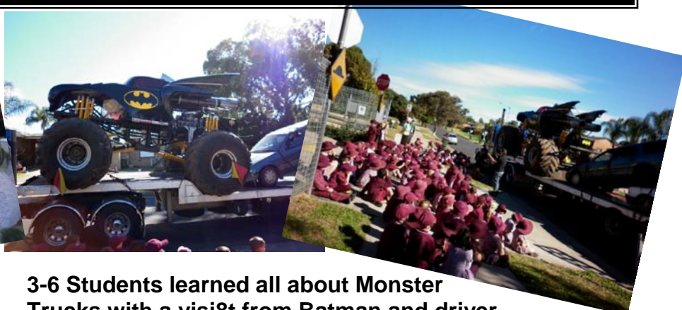
3-6 Students learned all about Monster Trucks with a visit from Batman and driver Troy!