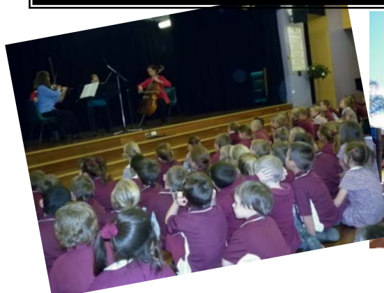
K-2 Students enjoying the visiting String Quartet

If you would like your newsletter emailed home, please contact the school through our school email address, or ring the school. Muswellbrs-p.school@det.nsw.edu.au