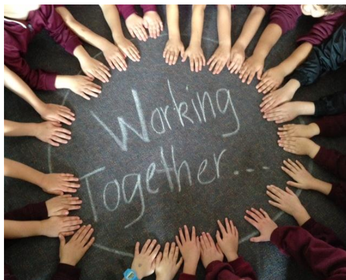
K/1C Working as a team