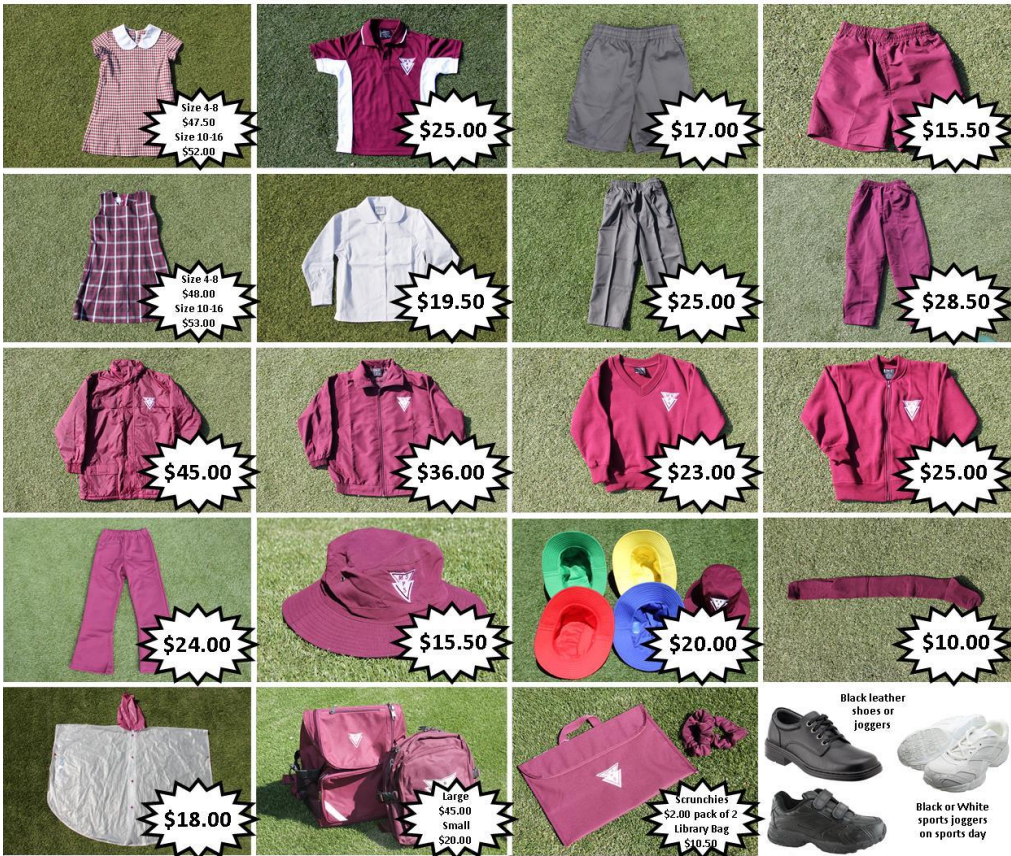
Winter Sports Uniform

Located at the school canteen. Accept cash, cheque and eftpos. Lay-by system available.