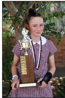
Skellatar house captain accepting the Cross Country Ford trophy for Cross Country