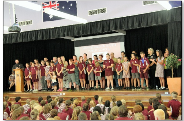
Induction of House Sports Captains for 2018