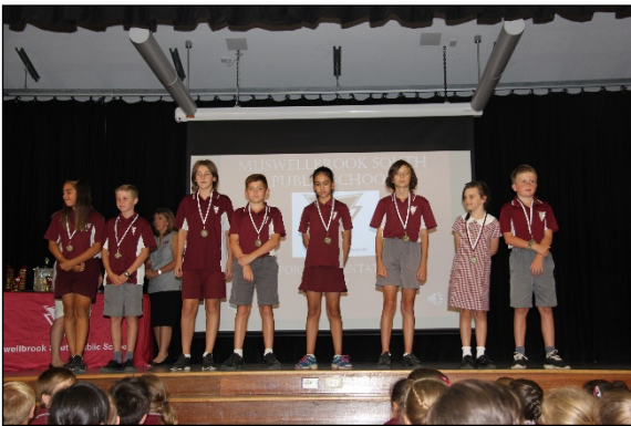
Cross Country Age Champions