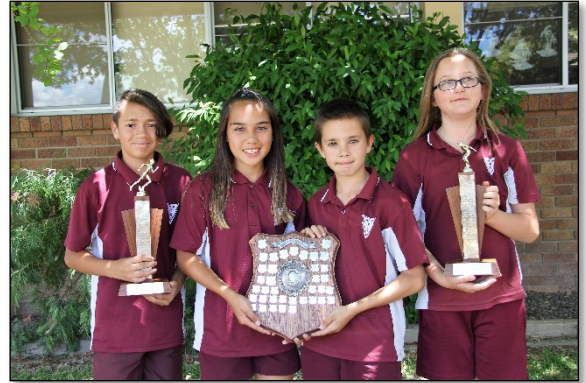
Edinglassie House leaders accepted the Kel Adams trophy for swimming, Kel Adams trophy for athletics and overall winning house