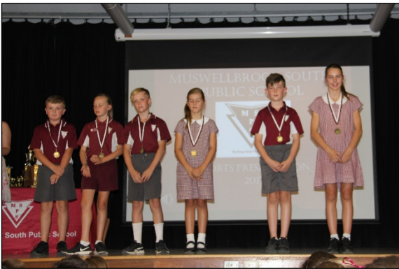
Swimming Age Champions

Our Sports Presentation was held last Friday. Congratulations to all the award recipients and thank you to all family members and friends who attended. The Sports House Captains for 2018 were announced and a family member/friend had the privilege of pinning the house badges on the new house leaders. Names and photos of the new sports leaders will be in next week's newsletter.