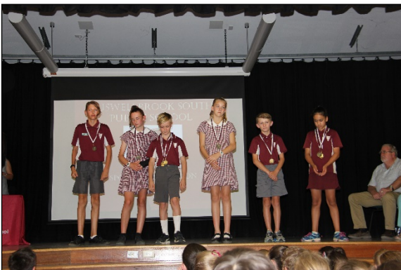
Athletics Age Champions