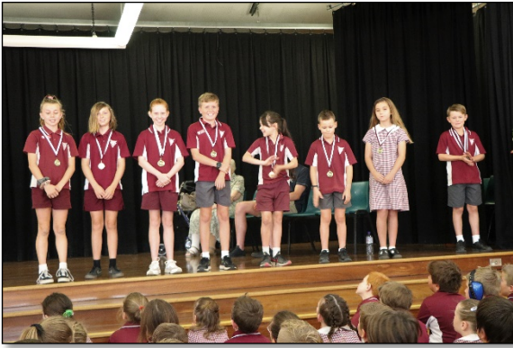
Cross Country Age Champions