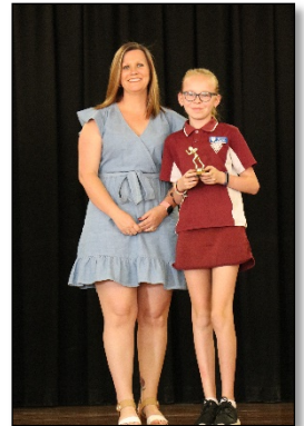
Coaches award for girls Touch Football