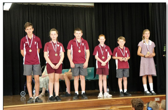
Swimming Age Champions