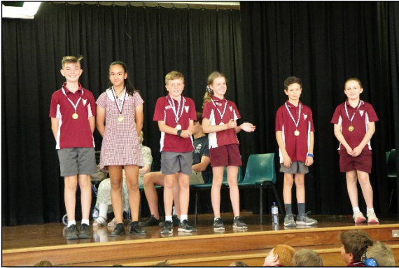
Athletics Age Champions