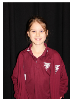
Siena P Participant in Prepared Speech - Individual - Senior Primary