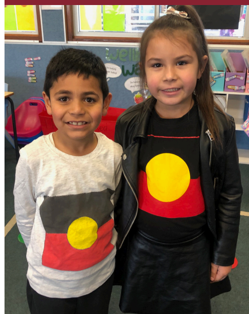
Supporting NAIDOC Week