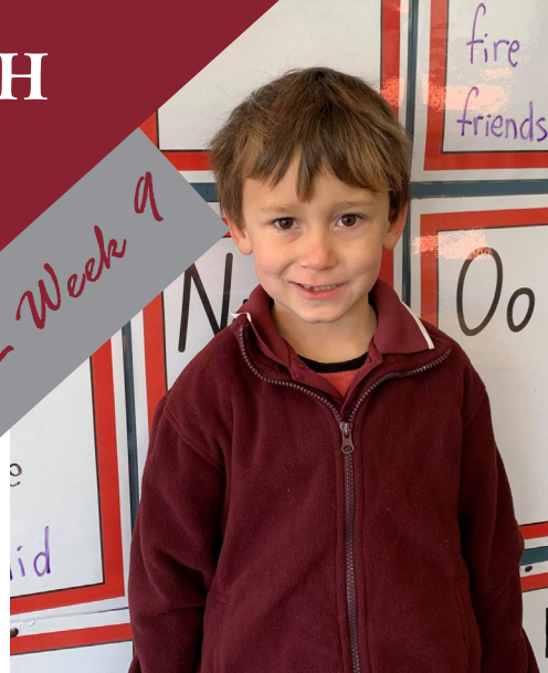
ATSI Student Spotlight