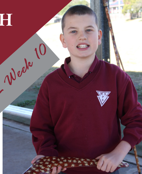
NAIDOC Week activities

Please help us to protect the environment whilst earning reward points to redeem on new sports equipment for our school. Thank you.