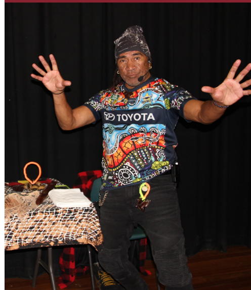
Dion Drummond performance