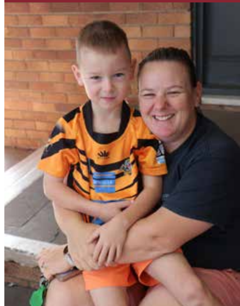
Harmony Day Yarn Up Breakfast