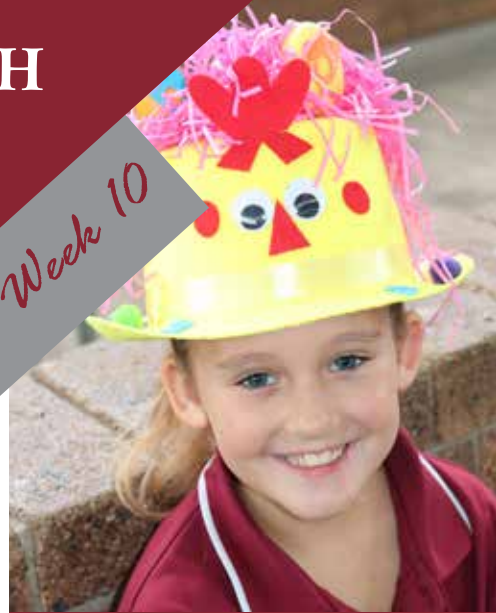
Easter Hat Parade